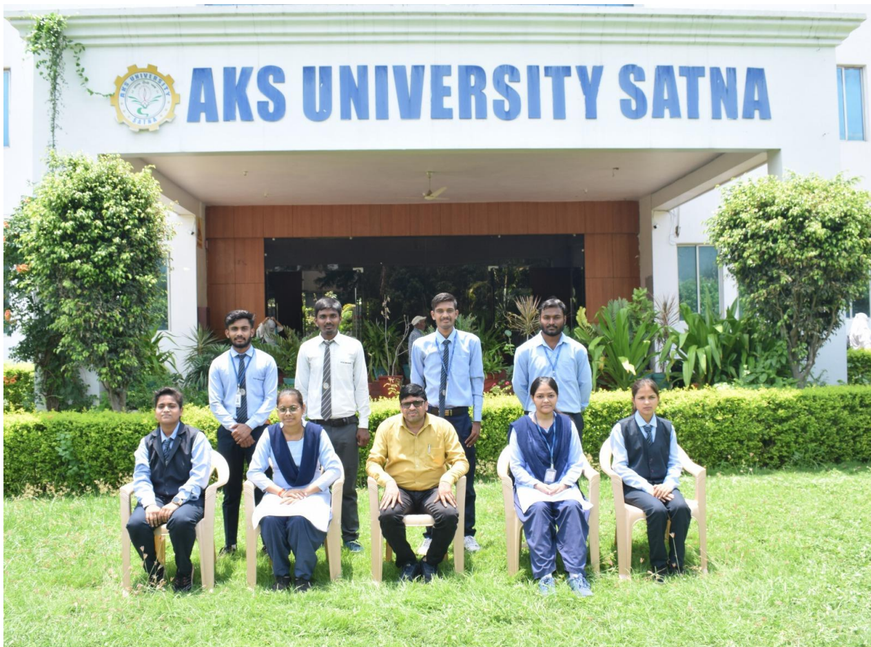
Social affairs and community service committee

Telephone No.: 08889537776 Extn. 238 Website: www.aksuniversity.ac.in