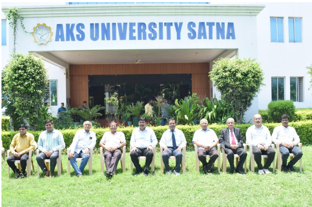
Administrative Body of Student Council

Telephone No.: 08889537776 Extn. 238 Website: www.aksuniversity.ac.in