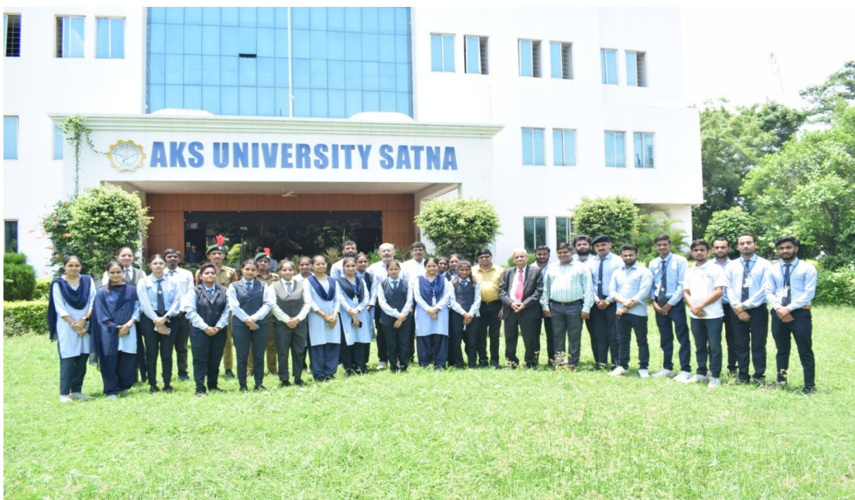
Student Council Members