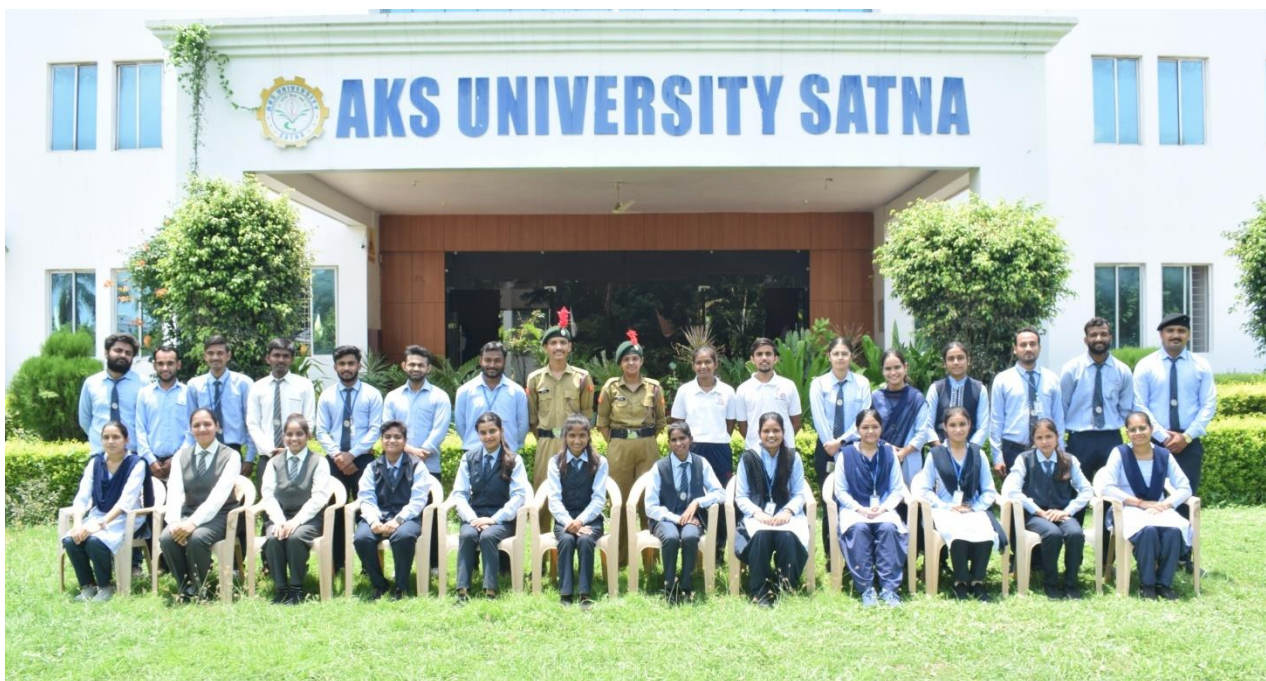
Nominated Students by Departments for Student Council

Telephone No.: 08889537776 Extn. 238 Website: www.aksuniversity.ac.in