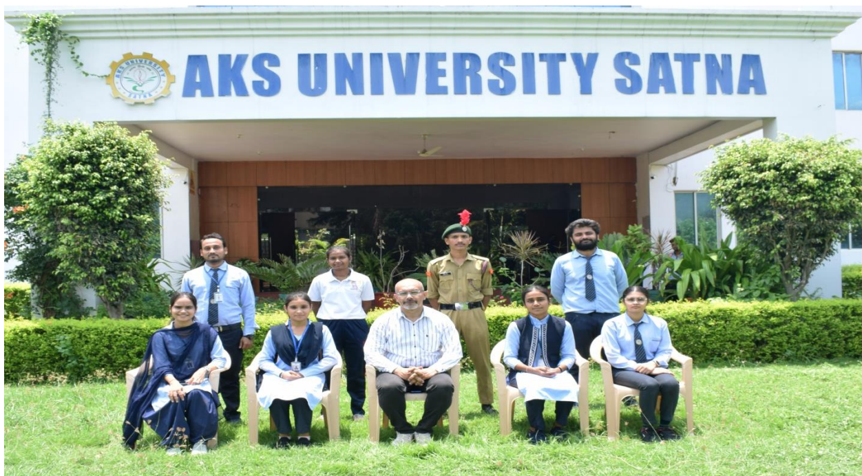
Environment & Sustainability Committee